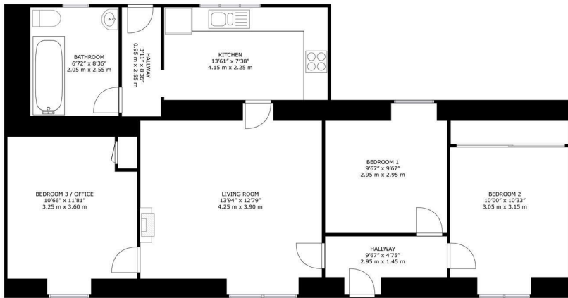
3 Bridgend of Carse, Grange, Errol PH2 7TB

GROSS INTERNAL AREA TOTAL: 738 sq.ft, 68.6 m 2